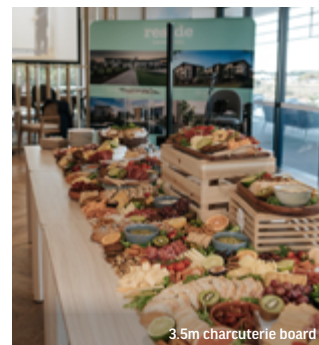
3.5m charcuterie board

If you missed out on attending but are interested in seeing the luxurious lifestyle on offer for yourself, secure an appointment with our team at esperancehopeisland.com.au