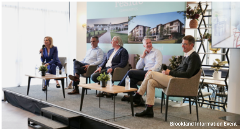
Brookland Information Event