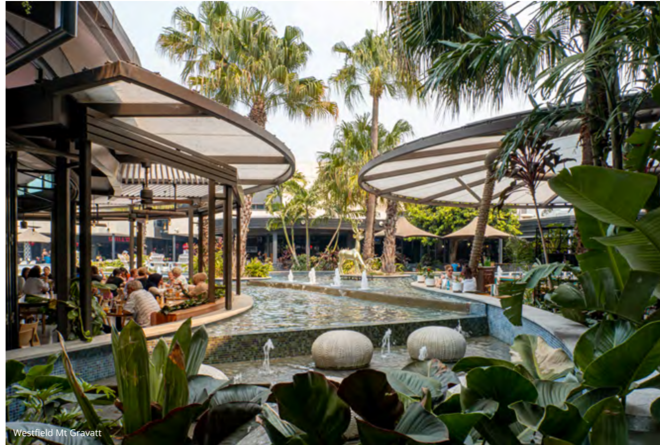
Westfield Mt Gravatt

Let's bowl! Just 5.3km down the road is Mt Gravatt Bowls Club, a club enjoyed by many locals for its competitive and social bowls. Head there for the bowls, but stay for the atmosphere and a well-earned beverage.