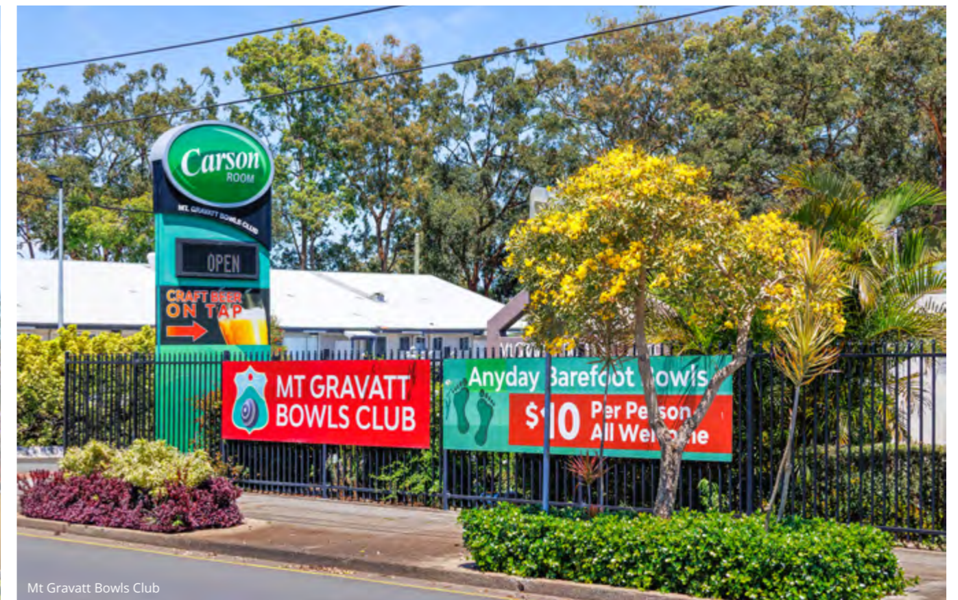
Mt Gravatt Bowls Club