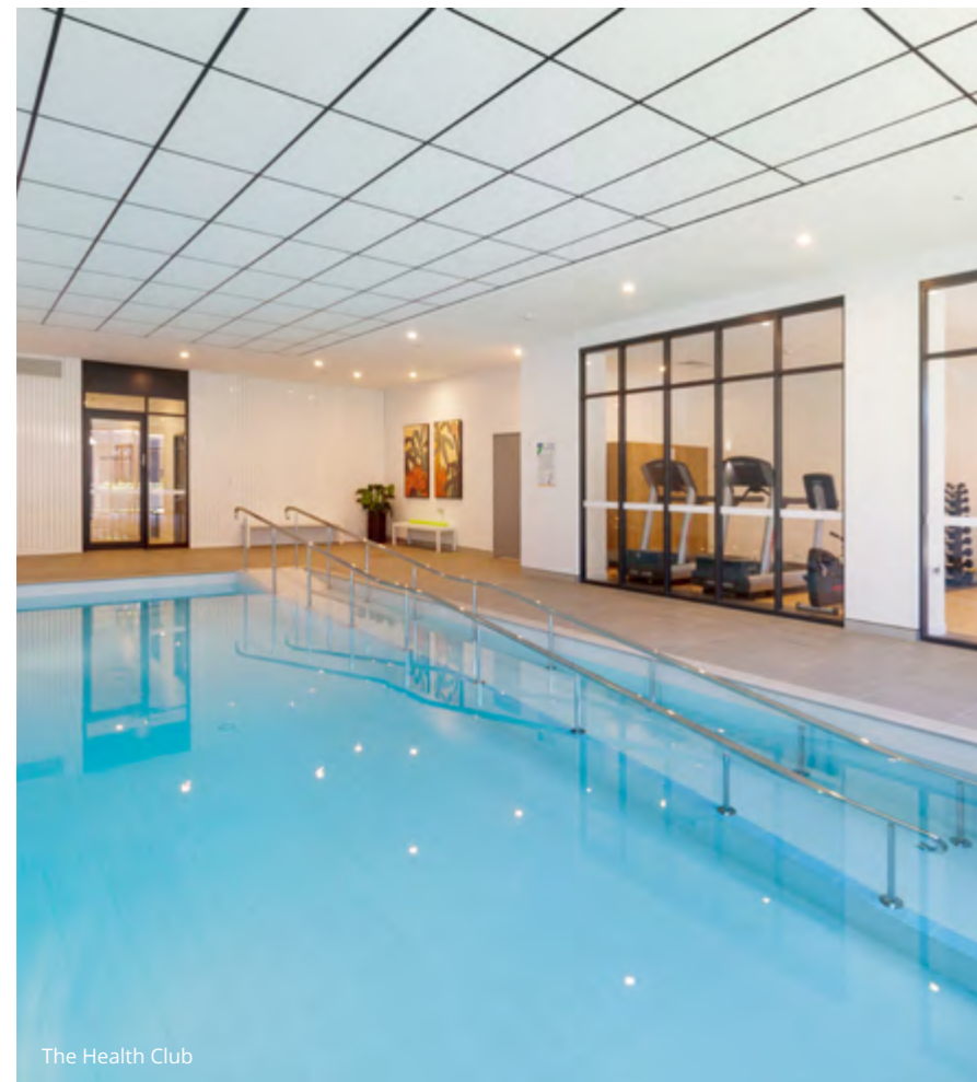
The Health Club

Treat yourself to a fresh cut or pamper session by booking an appointment with our visiting professionals in the hair and beauty salon.