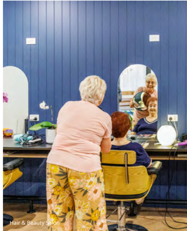
Hair & Beauty Salon

The Clubhouse is where life really thrives, right at the heart of Brookland.