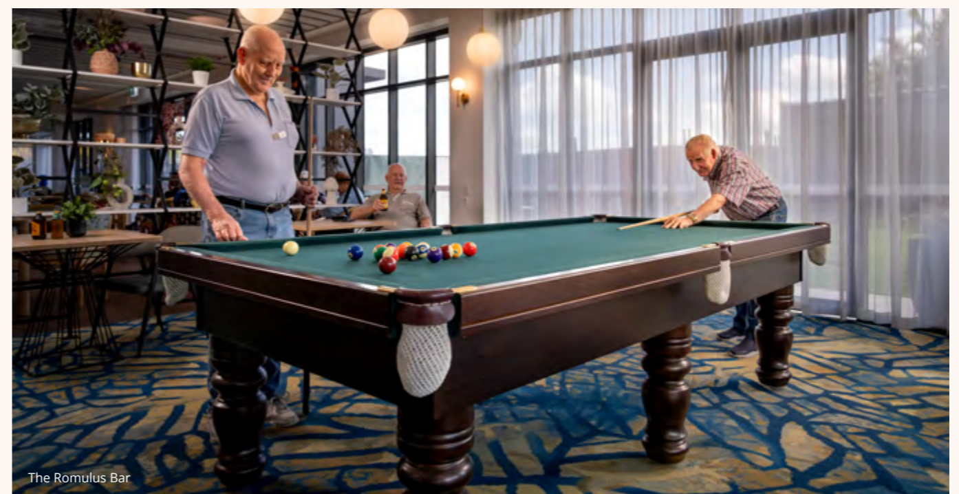
The Romulus Bar

Conveniently located within the Clubhouse, our private dining room is available for bookings. Whether you choose to bring in external catering for a stress-free experience or do the cooking yourself, it's the perfect setting to celebrate that special occasion or host a family get-together.